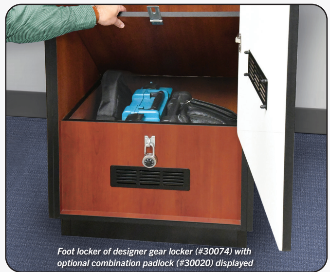
Foot locker of designer gear locker (#30074) with optional combination padlock (#30020) displayed